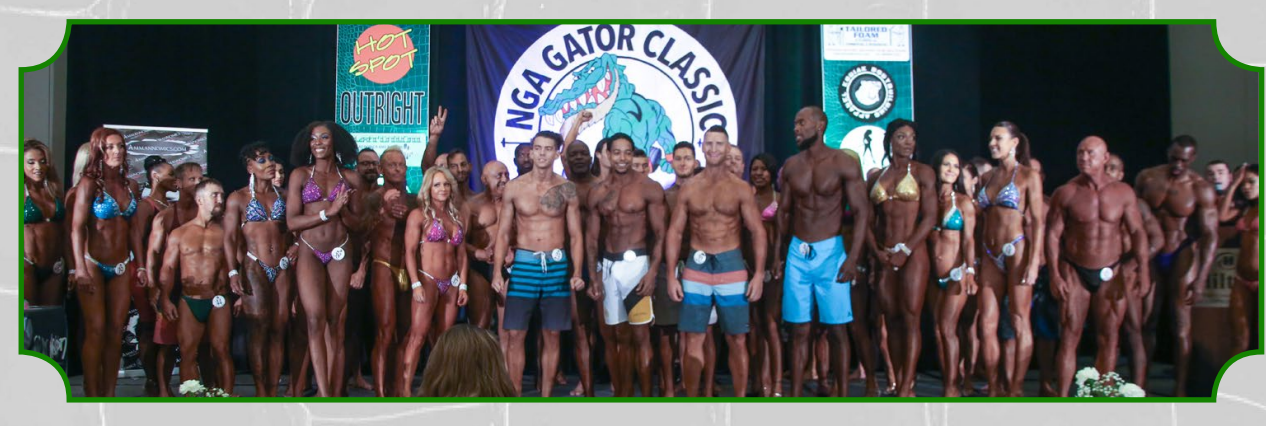
2020 NGA 9th Annual Gator Classic PRO/AM Contestants

thegatorclassic@yahoo.com instagram: @ngagatorproductions instagram: @mattammann1